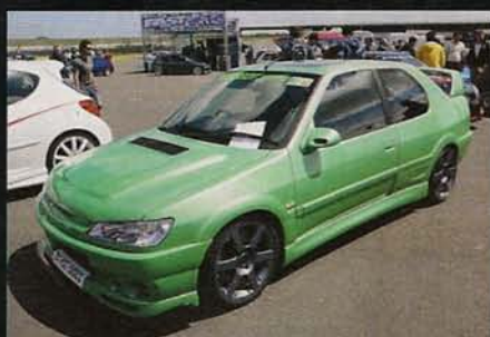
Ecosse modified this 306 sedan shell to three door spec, fitted Mygale II front bumper, splitter, arches and side skirts with Esquiss de-badged grille – then dropped in a 2.0-litre 16v turbo lump from a 405 T16!