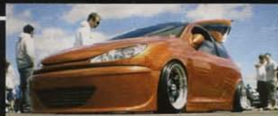
Wild Pug 206 belonging to Ulric Persyh was awarded Meguiar's Car of the Show