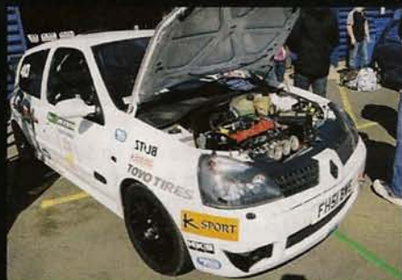
This car's been prepared by GDI Performance Tuning for the Time Attack Amateur Club Class where it will be up against Skylines and Evos with three times the horses. However, with its 240bhp full race engine it's guaranteed to put up quite a fight

In the meantime, we'll let the pictures from this year's event speak for themselves. There's more club pics on p82-83.