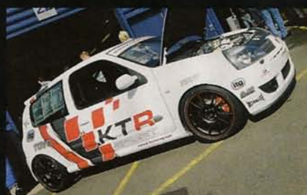
K-Tec was showing what it could do with the Renault Clio 172 Sport – very impressive. This car featured alcantara dash and doorcards as well as the firm's exciting new titanium 2.5in cat back exhaust. A full feature is coming soon...