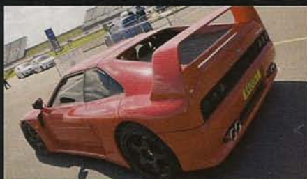
There were actually two of these ultra rare French built Venturi R400GTs at FCS. Based on a spaceframe chassis with fibreglass body it uses the Peugeot/Renault V6 powerplant, twin turboed to produce 400bhp. 0-60mph is quoted at 4.7secs