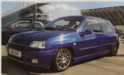
Clio16valver had a fabulous display of cars at the show, including this very nice Imperial Valver (above) and rare Dimma bodied example (below)

Particularly impressive, too, was the parade of Renaultsport cars lead out by Renault top man Jeremy Townsend to raise money for the Warwickshire and Northamptonshire Air Ambulance (WNAA).