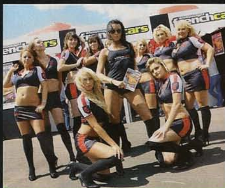
Flux Babes are all employed in the Adrian Flux office. Hmm... wonder if they've got any vacancies?