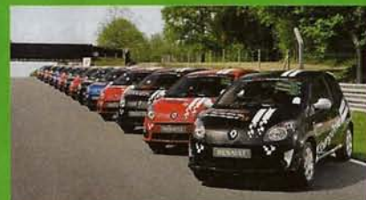
14 New Twingo GTs will be thrash..., er, driven by 14-17 year olds at Brands and Oulton Park. Other Renaults will be used as back up vehicles at other MSV circuits

performance Mégane Renaultsport 230 F1 R26s and Clio Renaultsport 197s for MotorSport Vision's corporate driving events and RaceMaster experiences at Brands Hatch and Oulton Park – and we've got a day's course pencilled in for a future issue – so watch this space.