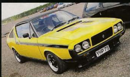
Fabulously preserved old skool Renault 17 belonged to Antony Louies from the West Midlands. There's a Fuego turbo lump lurking under the bonnet...

Hot news straight off the press is that provisionally the event will be held in 2009 at the same venue, sometime during late June with dates to be confirmed subject to the race calendar.