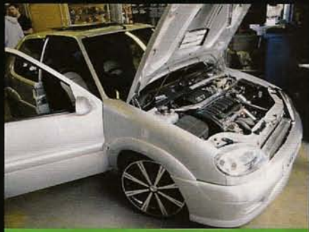
Hertfordshire-based specialist Carworx had some sensational cars in its FCS garage, including this 430bhp Saxo VTS Turbo. It too will be in PFC...