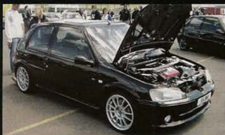
Steve Saunders' gleaming black 106 was voted Best Peugeot in Show in Meguiar's Top 25