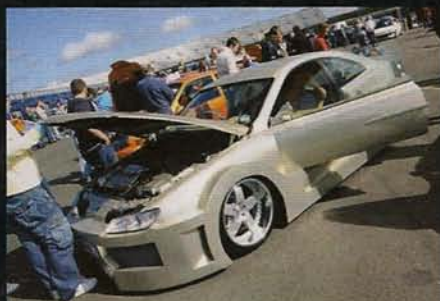
Warren Crawford's 'Gold Digger' project 406 Coupé with its hand-made stainless wide arch bodykit attracted plenty of attention. A bulging 14in wider than standard, virtually every panel has been modified in some way. Inside there's carbon Cobra Misano seats and lots of LEDs...